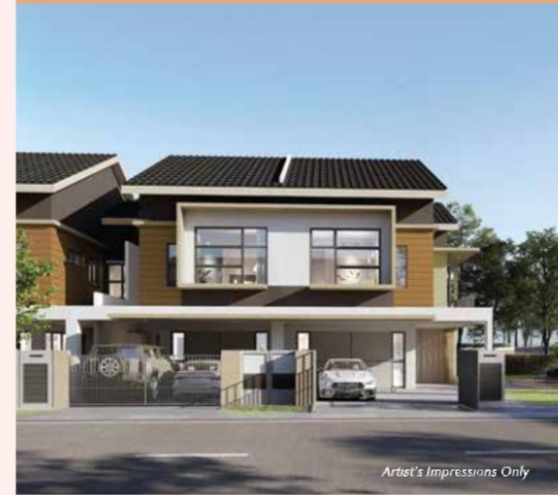
Artist's Impressions Only

The facade design adopts a minimalist approach, incorporating a roof pitched to the side, which elevates the overall grandeur with its raised central ridge. Adjacent to the main entrance is a semi-courtyard area that can potentially be converted into a serene private zen garden.