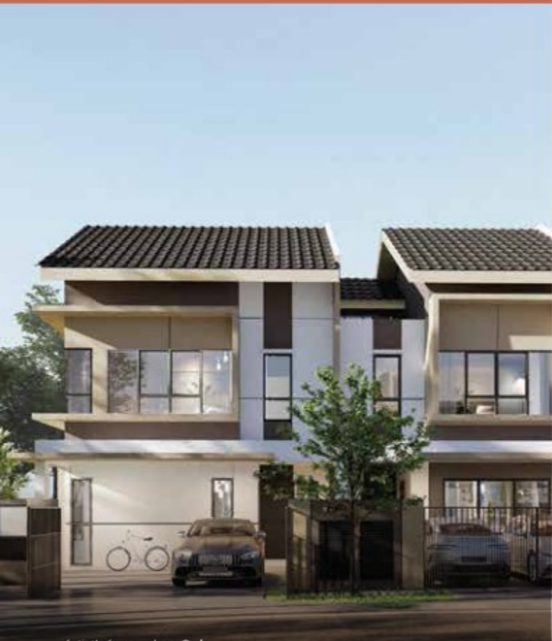
Artist's Impressions Only

The exterior design showcases an aesthetically pleasing facade featuring a modern front-pitched roof. Inside, the layout is seamlessly arranged, creating an atmosphere of openness that facilitates flexible and dynamic design arrangements.